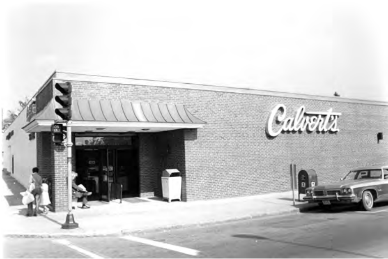
Figure 6.4: Calvert's Clothing Store, June 1979.