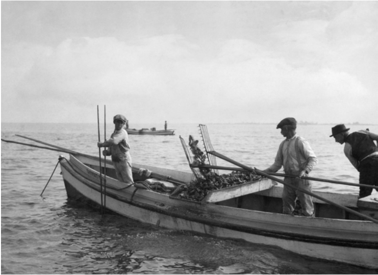
Figure 2.5: Oyster tongers.

Long Island Sound and New Jersey at first, and eventually from Virginia, “planting” them in the spring and then harvesting the fully-grown oysters in the fall and winter. Ships would bring the oysters into Boston from Wellfleet on Cape Cod, or other planted beds in Narragansett and Buzzard’s Bays. Sailors unloaded the oysters at the docks near Faneuil Hall and sold them to local dealers and peddlers. [34]