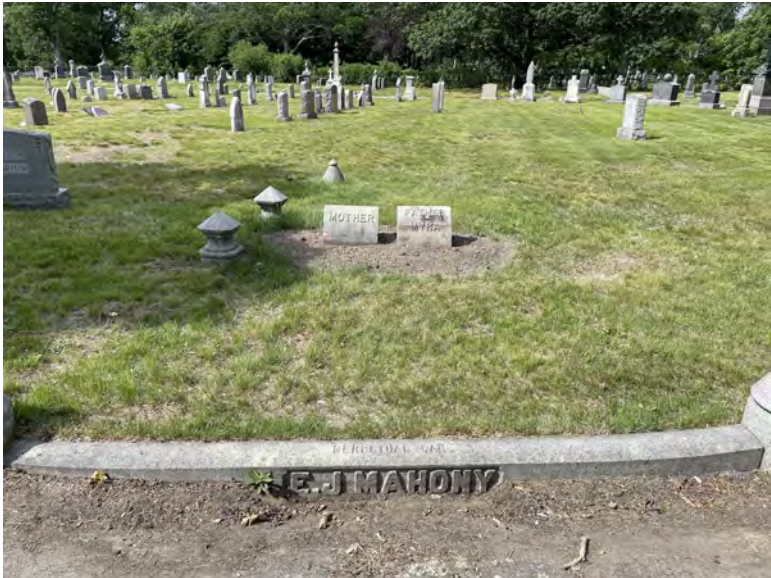
Figure A.4: Mahoney/Mahony family plot, Mt. Calvary Cemetery, Boston (Roslindale), Suffolk County, Massachusetts.