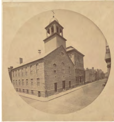
Figure 2.4: St. Mary's of the Sacred Heart Church.