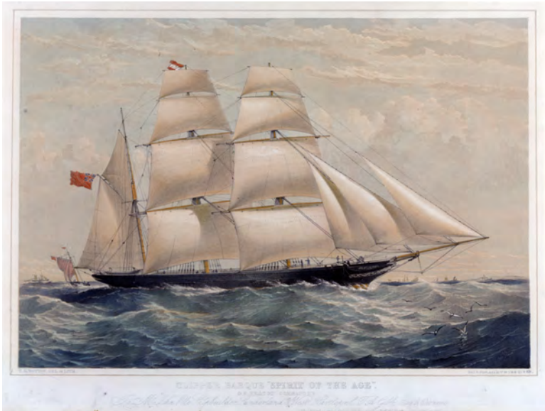
Figure 2.1: Example of a clipper barque from 1854.