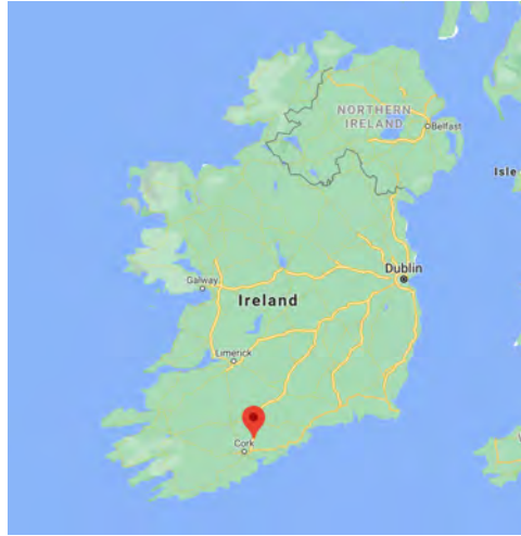
Figure 1.1: Map of Ireland with pin indicating the location of Watergrasshill.

from the latter City to Fermoy – a good deal of benefit is done the Town by these persons — [6]